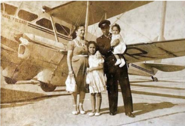
Figure 1. The world's second black pilot, on the top image, Lieutenant Eugene Bullard was beaten by racist New York police and died while working in a perfumery store in the 1950s. At the bottom, the world's first black pilot, Colonel Ahmet Ali Çelikten, retired from the Turkish Air Force with a medal of honor.

Ahmet Ali Bey was also called Arab Ali in public. This is a common word usually used for African Muslims to signal their regional origins. People like pilot Ahmet Ali Bey, famous musicians and Turkish movie stars of African origin have been given positive recognition in the Turkish public sphere from to past to the present [2]. In order to identify their national origins, most of them preferred to use particular surnames to indicate their Afro-Ottoman identity. Unlike these notable actors and musicians, pilot Ahmet Ali Bey used the Celikten surname which means "steely" and solid [3]. In this article, I will look at the life and legacy of pilot Ahmet Celikten from the decline of the Ottoman Empire to the emergence of modern Turkey [4].