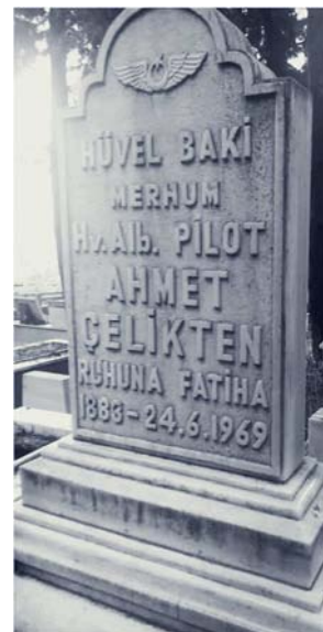
Figure 9. Pilot Ahmet Ali Bey's gravestone, Turkey.