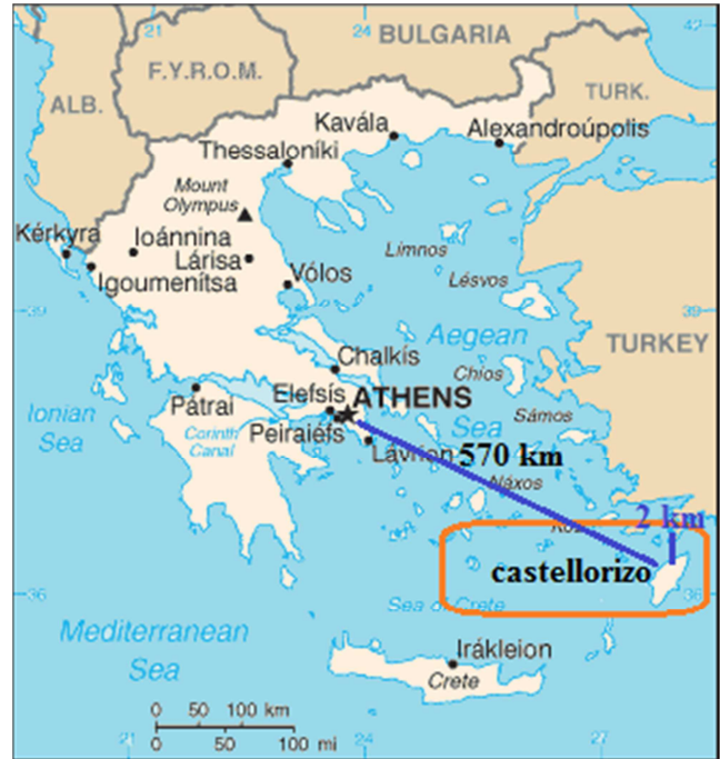
Figure 6. Kastellorizo Island.

worrying is the support of EU and US members for the Greek government. The European Union and the United States support the Greek government in what they call Turkey's “geopolitical territory building” in the eastern Mediterranean to make greater use of the region's energy resources [36].