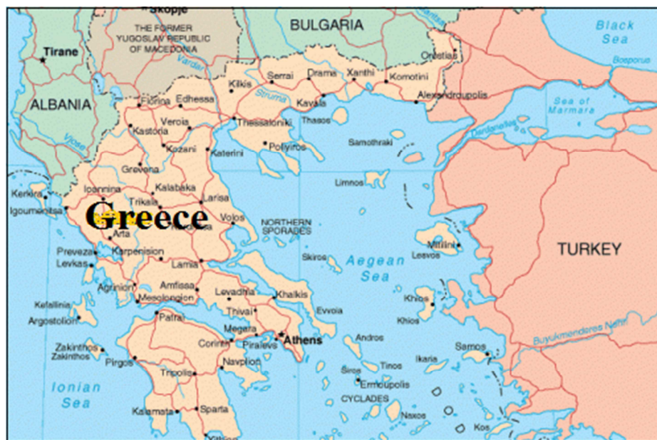
Figure 2. Greece (Darbandi, 2013: 20).

are inhabited. Many Greek islands have been sold, and many of them are owned by the richest people in the world. Greece is the confluence of three continents of Asia, Europe, and Africa. It is the heir of ancient Greece, the Byzantine Empire, and nearly four centuries of Ottoman rule. Greece is currently a member of the European Union and the North Atlantic Treaty Organization (NATO). Greece's political system is a parliamentary republic and most of its citizens are Christians.