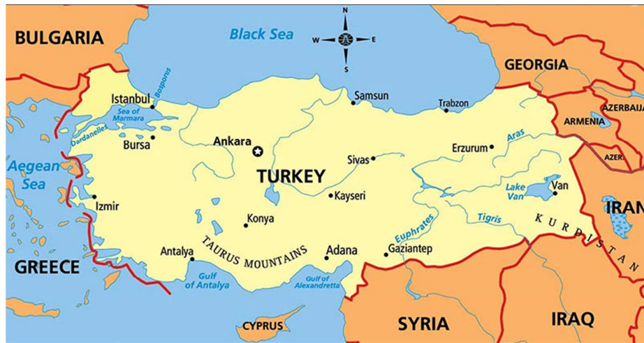
Figure 1. Turkey (Karimi, 2018: 100).

the Mediterranean Sea from the southwest [10]. Located in one of the most sensitive regions of the world, Turkey has a very strategic and important geographical location and is considered the crossroad between Northwest Asia and Europe. Many countries, including Iran and Iraq, use Turkish territory for the transit of goods and energy (Figure 1). In recent centuries, Turkey, known as the Ottoman Empire, has ruled large parts of the Middle East, North Africa, and Southeast Europe, including Greece. The political system of Turkey is a presidential republic with a single parliament.