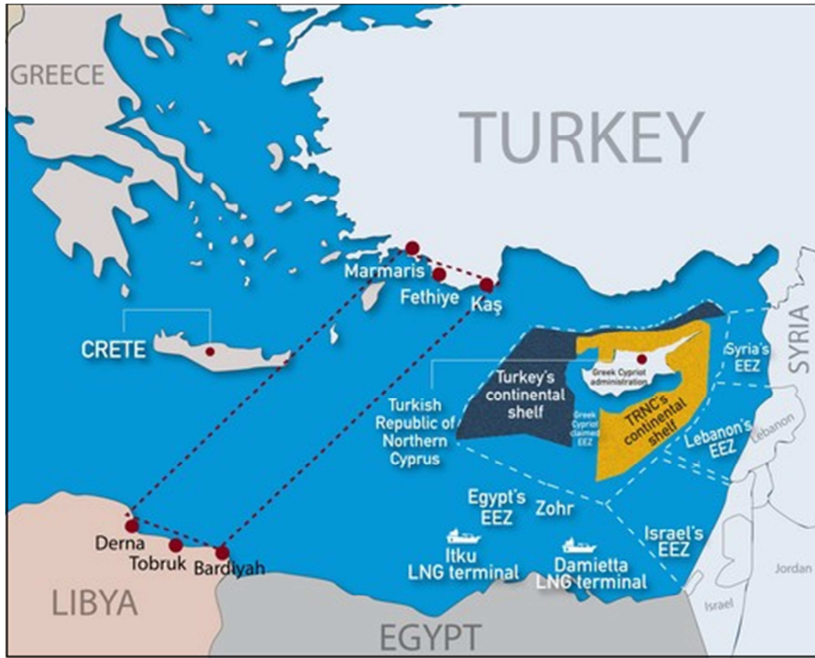
Figure 4. The exclusive economic zone between Turkey and Libya.

The Turkish officials do not have the same position in dealing with Greece and each thinks differently. In other words, they do not have the same strategy, and this is a special privilege for Greece. Unlike Erdogan and his party, who have repeatedly warned of war and threatened the Greek government with war, Ahmet Davutoglu, a prominent Turkish strategist, and former Turkish prime minister has taken a more moderate stance, saying that although Turkey is objecting to Greek greed in the Mediterranean, it is not a good option to solve this problem. He believes in dialogue between the parties and a diplomatic solution to the issue [35].