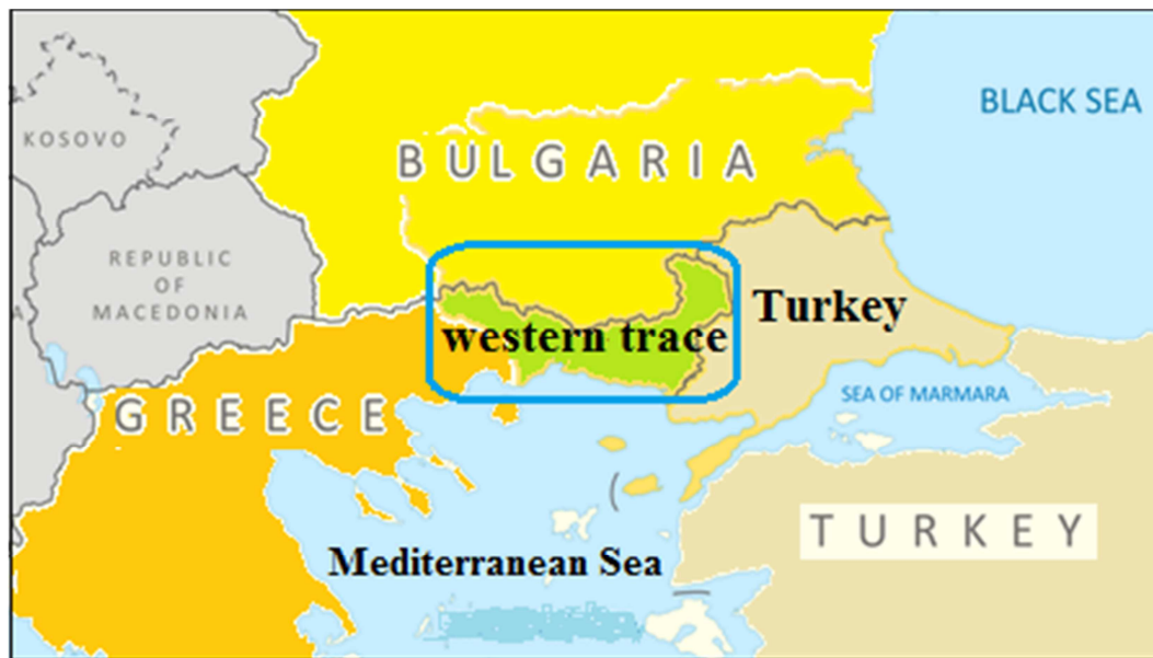
Figure 7. Western Thrace in Greece.

living in the region and is seeking Greek recognition as a “Turkish minority and full rights”. But the Greek government says they are 120,000 Greek Muslims, referring to the group as a “Muslim minority” [28], and warns the Turkish government that it will never allow it to be exploited in the form of geopolitical affiliations and engender Greece’s national security. However, the Turkish government accuses the Greek government of violating the rights of the Turks, saying that under the Lausanne agreement, the Greek government’s actions violate the legal status of the inhabitants of Western Thrace, which is located between the two countries.