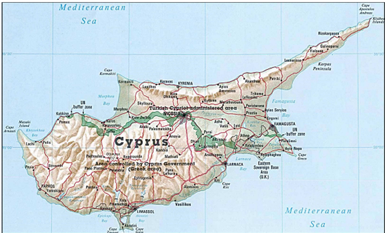
Figure 5. Island of Cyprus (Ghasemi, 2009: 80).

defending the rights of minorities. Cyprus was part of the Ottoman Empire for over three centuries. Early Greek Cypriots welcomed British domination of the island in 1878 because the British ended their status as a minority, and they mistakenly believed that with the help of the British, the island would soon join Greece [43].